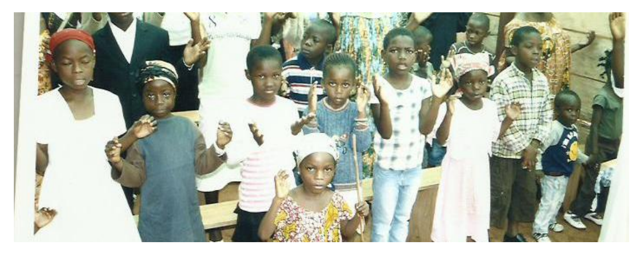
The children of St André, Ngoulemekong, Yaoundé, Cameroon