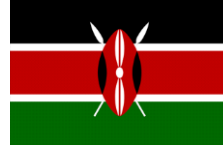
Republic of Kenya