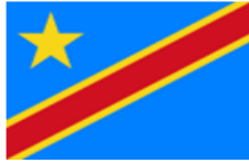
République Démocratique du Congo