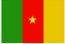
Republic of Cameroon