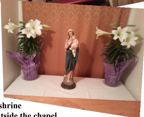
The shrine just outside the chapel.