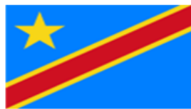
République Démocratique du Congo