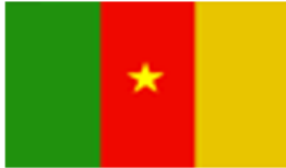
Republic of Cameroon