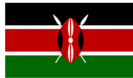
Republic of Kenya