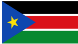
Republic of South Sudan