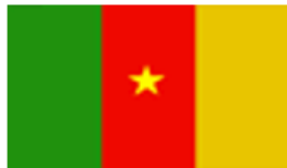
Republic of Cameroon