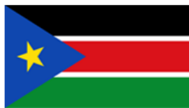
Republic of South Sudan